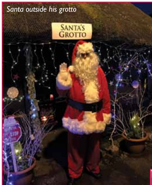
Santa outside his grotto