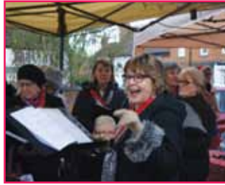
Dunchurch Voices entertain at Winter Wonderland

The choir has a long association with the