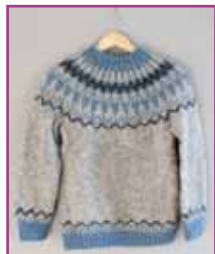
High wool content is best

YOUR OLD WOOLLY JUMPERS/BLANKETS AND SPONGES FOR RECYCLING