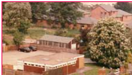
Top: Circa 1968, the new modern surgery to the left of the old bomb shelter. Bottom: 1980s, from St Peter's tower. Bomb shelter is now a tree. The surgery (foreground) has been extended.

In 1967, the Practice opened new premises adjacent to the old building. This was one of the first purpose-built GP surgeries in Warwickshire consisting of a modern prefabricated structure with a waiting room, plumbed toilets, a consulting room for each GP, telephones and space for a nurse and reception staff. Dunchurch Surgery was thus a pioneering practice of the time in preparing for the provision of modern GP care.