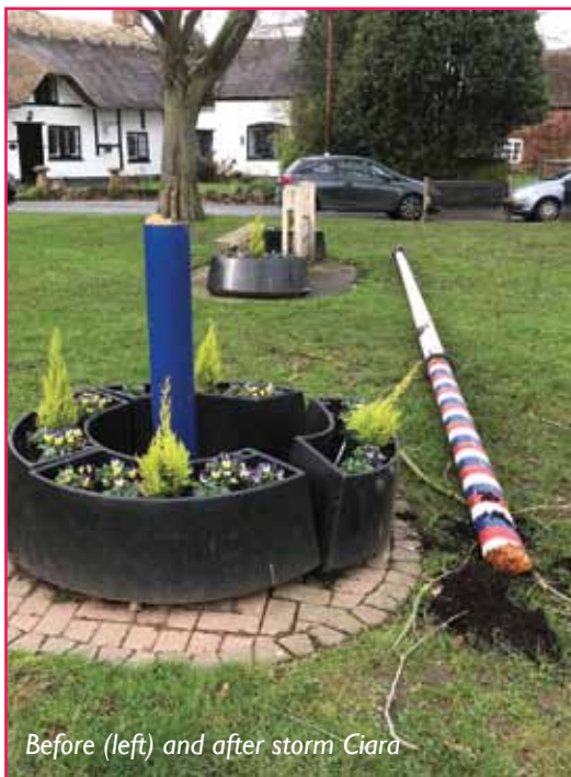
Before (left) and after storm Ciara

For now the maypole has been made as safe as possible and the flag has been removed.