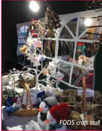
FODS craft stall

The face painting stall proved popular with our young folk, many of whom were transformed into wonderful walking works of art. However, the award for the biggest 'make over' of the day must surely go to our historic thatched bus shelter which transformed in to Santa's Lapland cabin delighting over 70 children who were