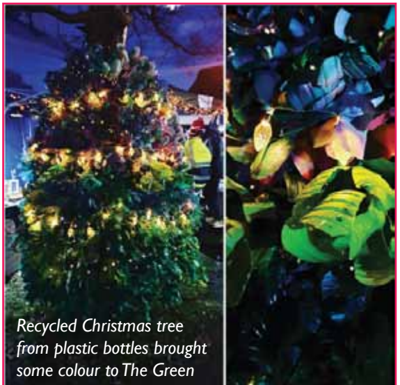
Recycled Christmas tree from plastic bottles brought some colour to The Green

ing on film and TV sets such as Game of Thrones, Braveheart and Dr Who, Brandon Thatchers Film Services Ltd were most generous in lending us fabulous props that brought so much joy and