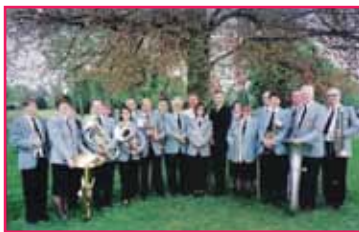
Dunchurch band 20 years ago

D unchurch Band is YOUR village Brass Band and has been making music, performing at village and local charity events, providing concerts and musical entertainment in and around Dunchurch for 110 years. We also provide tuition for anyone who wishes to learn to play a brass instrument and we have a thriving training band.